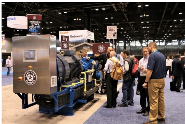
[GL5 Single-Stage Centrifugal Blower Package]

In addition to the GL-TURBO high-speed single-stage centrifugal blower cutaway and LS-series multistage turbo blower cutaway, we showcased a GL5 (Pressure Range 20-200 kPag/5-30 PSI, Power Range 132 -370 kw/175-500 hp) single-stage centrifugal blower package at our booth. The packaged system includes motor, lubrication system, cooling system, local control panel, inlet air filter, instrumentation, as well as the main blower.