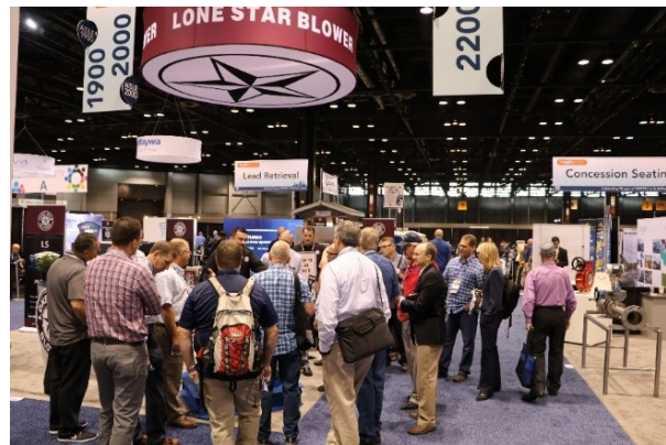
[A study group visited our booth after a wastewater seminar.]

In addition to the GL-TURBO high-speed single-stage centrifugal blower cutaway and LS-series multistage turbo blower cutaway, we showcased a GL5 (Pressure Range 20-200 kPag/5-30 PSI, Power Range 132 -370 kw/175-500 hp) single-stage centrifugal blower package at our booth. The packaged system includes motor, lubrication system, cooling system, local control panel, inlet air filter, instrumentation, as well as the main blower.